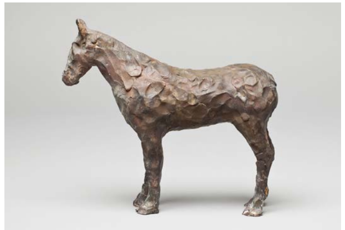
Primal, détail, 2013