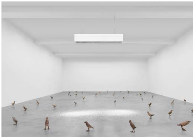
Primitive, 2011-2012 & Thank you Silence, 2005