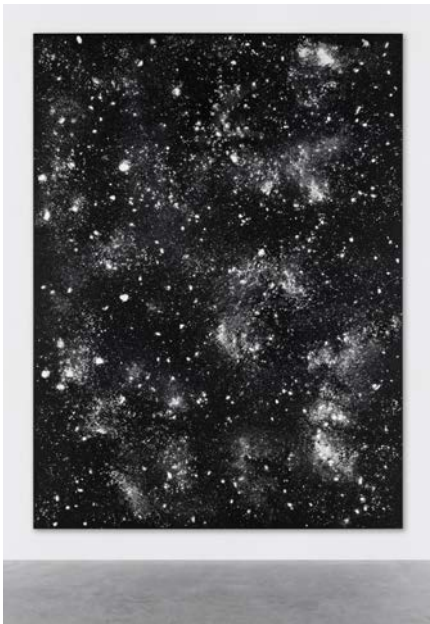
N° 559 dreissigsternovemberzweitausendundacht, 2008