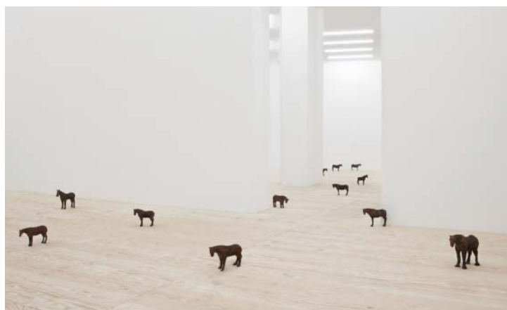
Primal , 2013, bronze. View of the exhibition at the Esther Schipper Gallery, 2013. © Ugo Rondinone

With the support of: Pro Helvetia ; Esther Schipper Gallery, Berlin ; Galerie Eva Presenhuber, Zurich ; Gladstone Gallery, New York & Brussels; Sadie Coles HQ, London