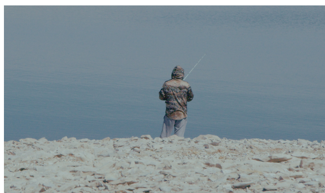
Vidéo El Cruce , 2022-2024.