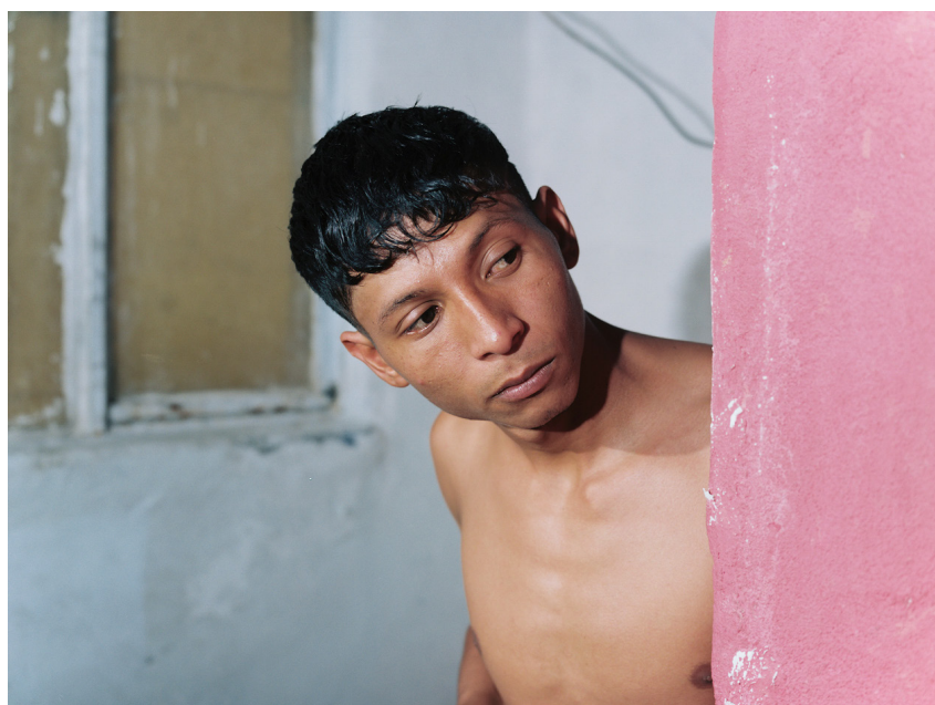
El Friki's friend and pink wall. BODIES.