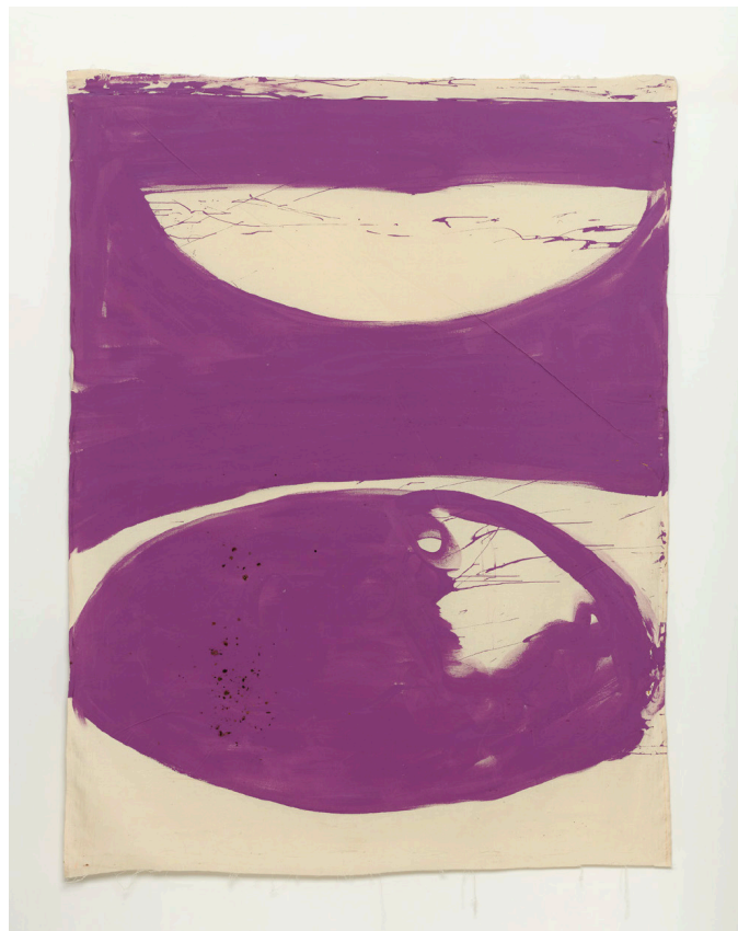
Nr. 17, Vivian Suter

The exhibition is accompanied by a four-language monographic publication, released by JRP Editions.