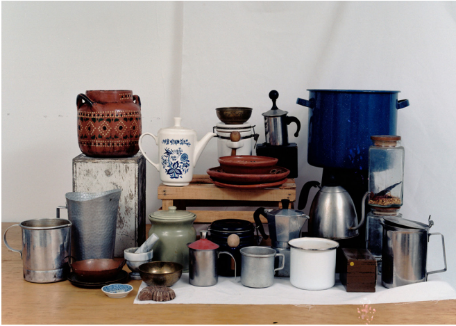
Utensils. Thom's house. BODIES.