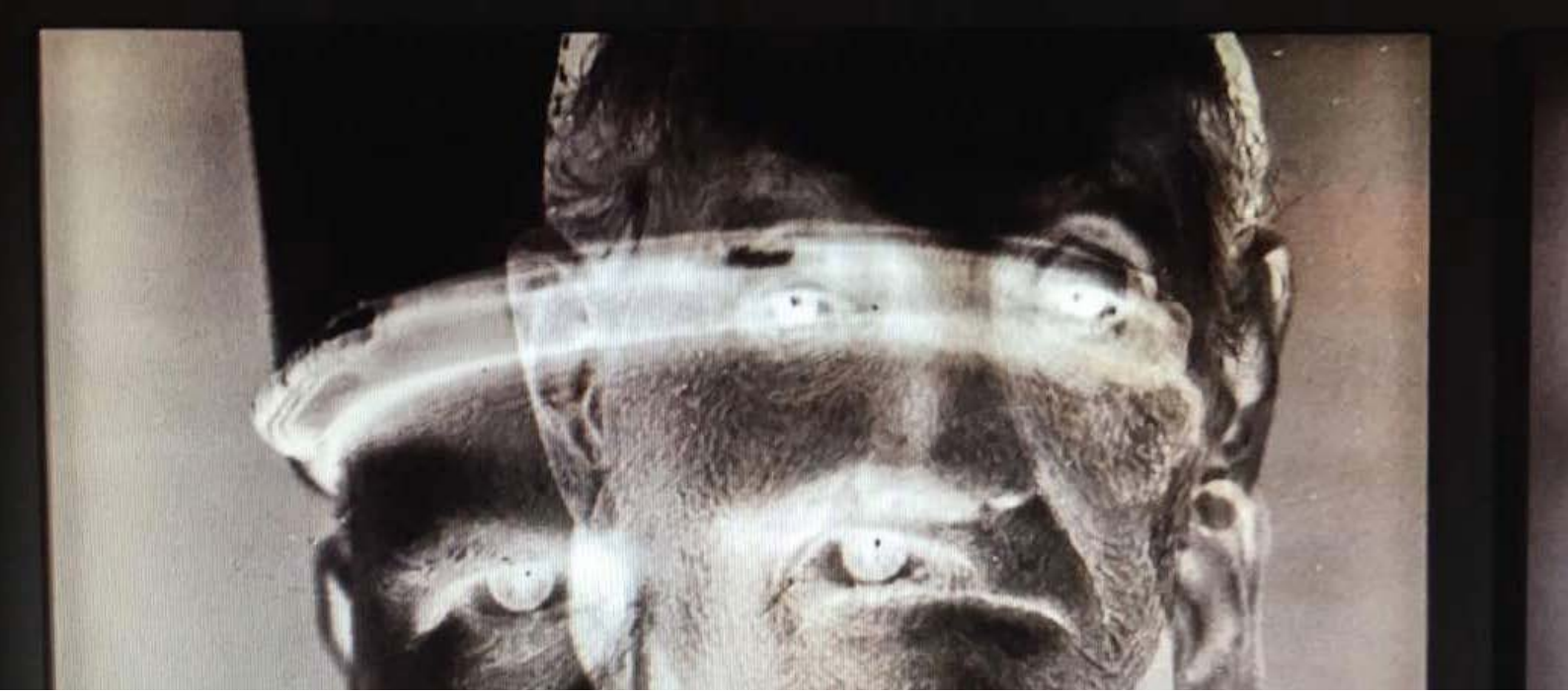
Akram ZAATARI, Faces to Faces #4, 2017 © Akram Zaatari