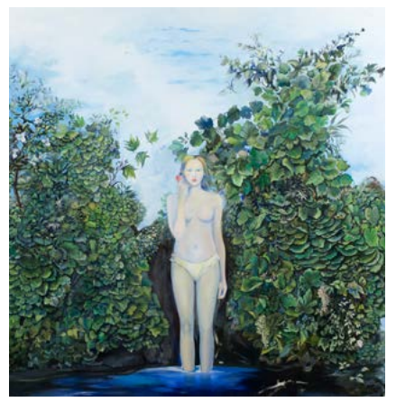
Martial RAYSSE, La Source , 1990 © ADAGP Paris

The Carré d'Art's thirtieth anniversary festivities will extend to other museums in the city, with a display of contemporary artworks that resonate with their collections.