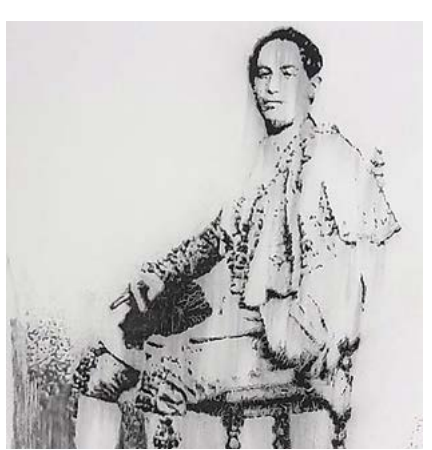
Sylvain FRAYSSE, Proposal for the La Feria poster, 2013. © ADAGP Paris 2023