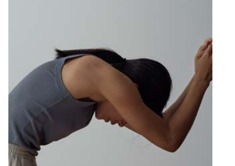
Noe SOULIER, Fragments , 2022, vue du film.