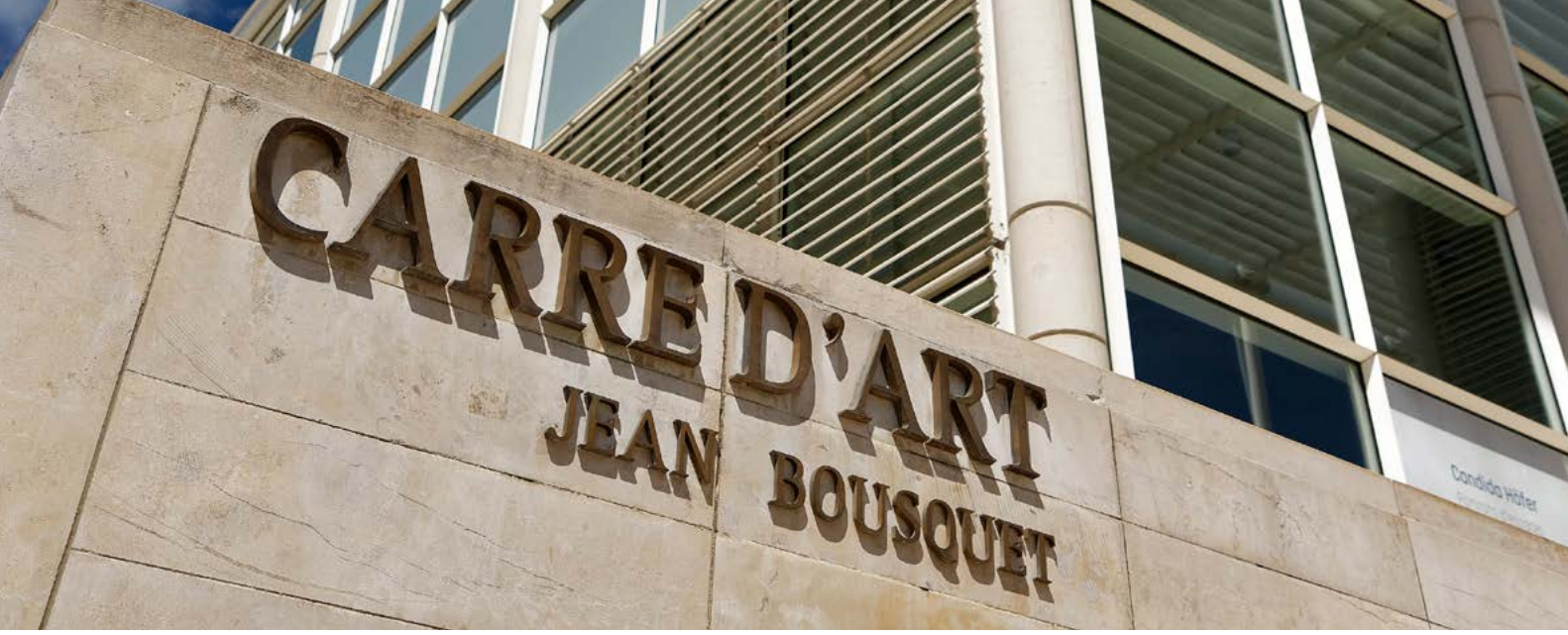
© Stéphane Ramillon - Ville de Nîmes