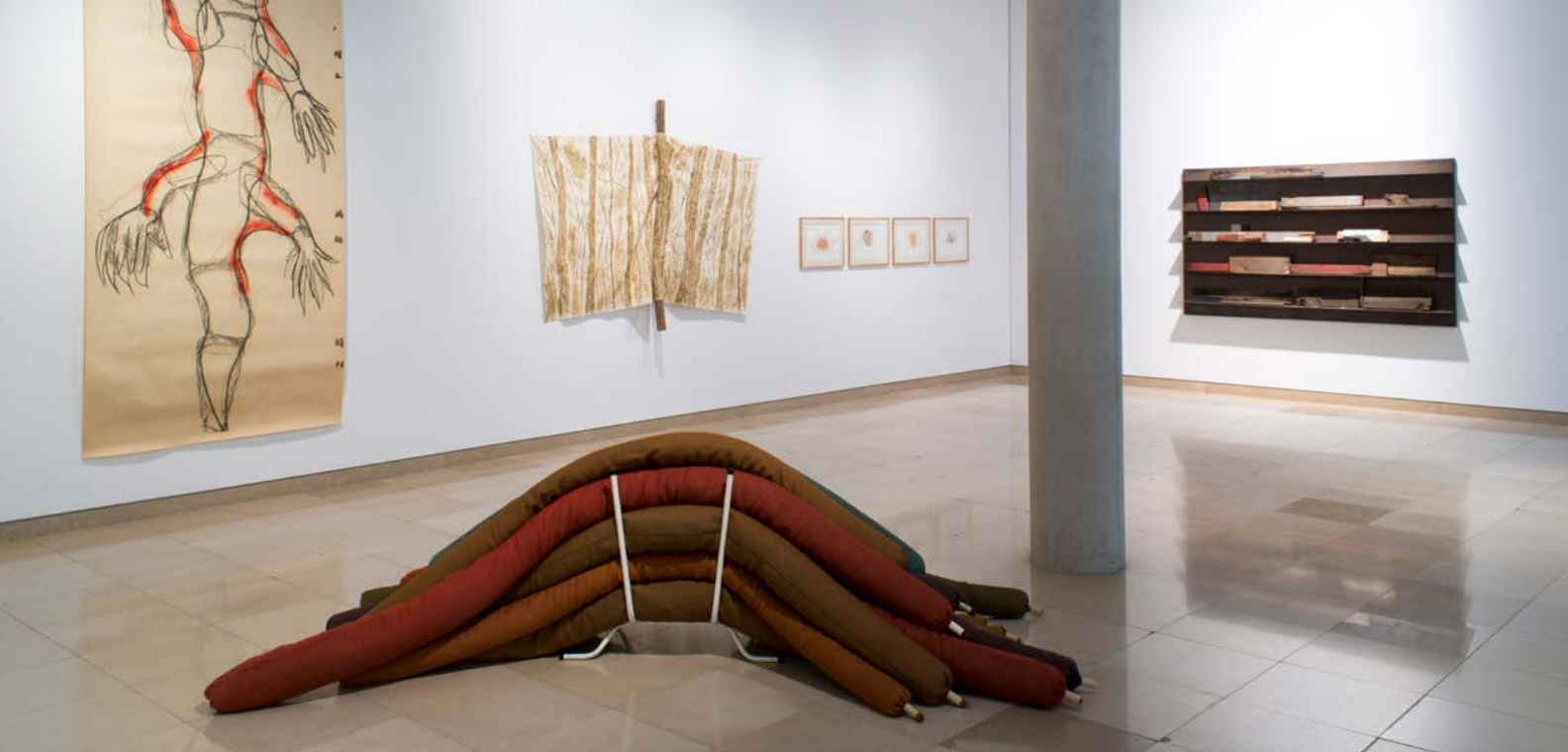
View, Arte Povera Room (photo C. Eymenier) © ADAGP Paris 2023