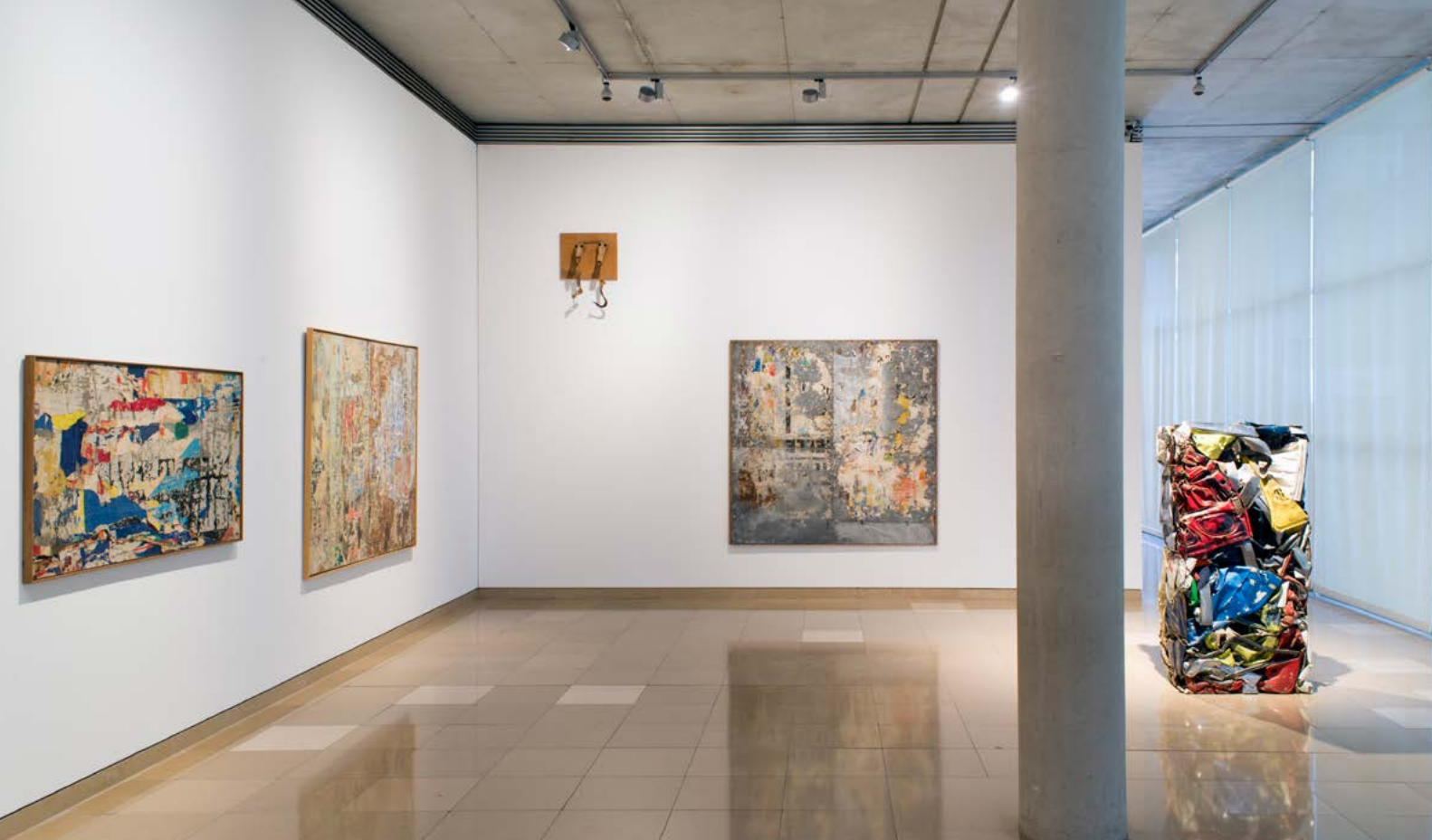
View of the Nouveau Réalisme section © ADAGP Paris 2023