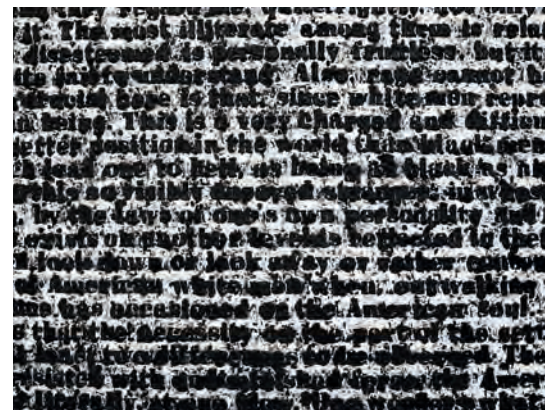
Stranger (Full Text) #1, detail, 2020-2021