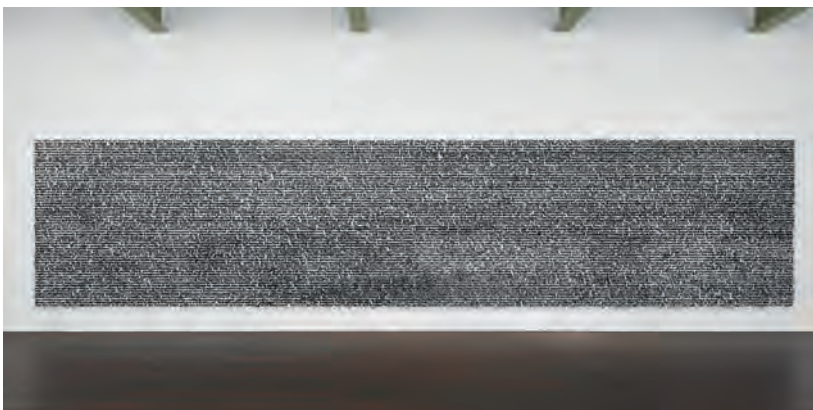
Stranger (Full Text) #1, 2020-2021