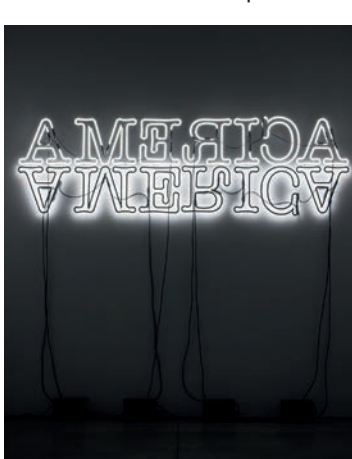
Double America, 2012

Also on view will be paintings inspired by workshops with young children as part of a residency at the Walker Art Center in Minneapolis in 1999-2000. Ligon chose Afrocentric illustrations from the 1960s and 70s for the children to color in, and then reproduced the results on large canvases to create a painting series called «Coloring».