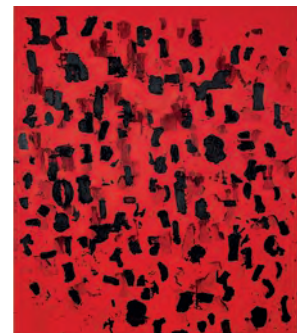
Debris Field (Red) #20, 2021

Contact: Delphine Verrières-Gaultier – Carré d'Art