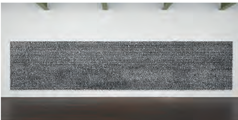
Stranger (Full Text) #1, 2020-2021