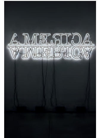
Double America, 2012