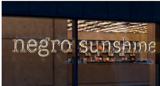
Warm Broad Glow II, 2011