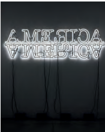
Double America, 2012

This exhibition at Carré d'Art will be the first one at a French institution.