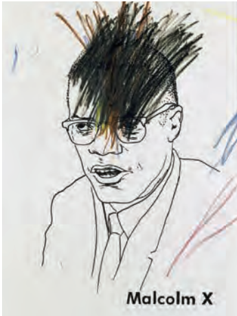
Malcolm X (Version 3) #1, 2000