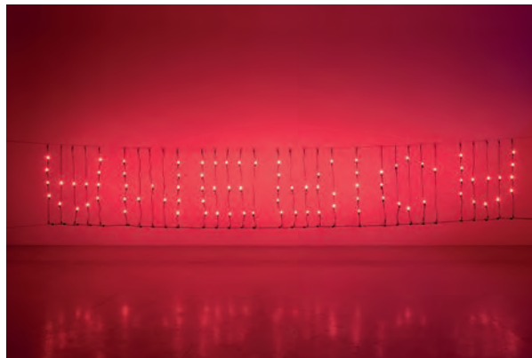
Untitled (America), 2019