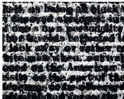
Stranger (Full Text) #1, détail, 2020-21