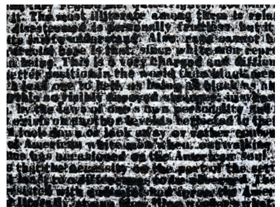
Stranger (Full Text) #1, detail, 2020-2021