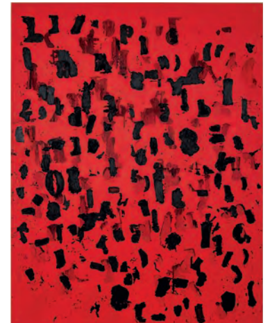
Debris Field (Red) #20, 2021