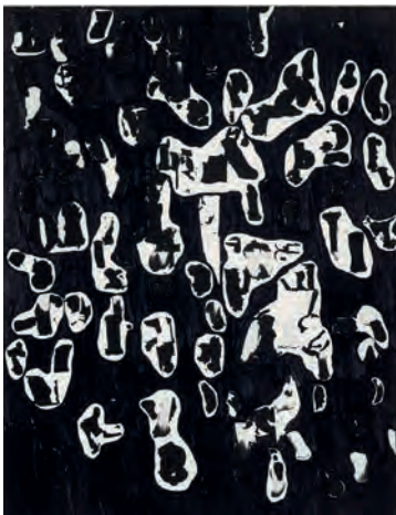
Debris Field #6, 2018