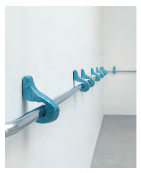
Von der Stange (Handlauf), 2014