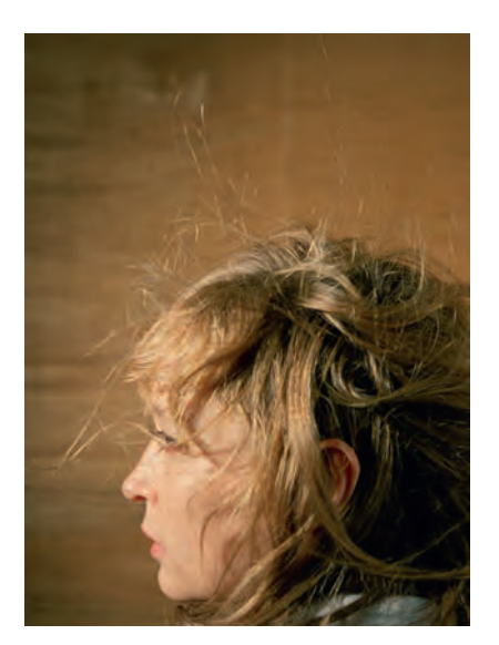
Es ist ausser Haus, 2006