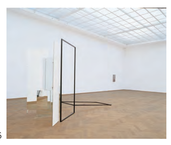
Das hübsche Eck, 2006