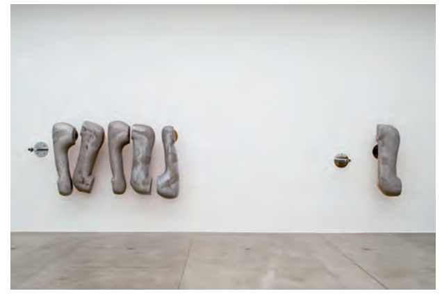
Deep Furrow, 2021