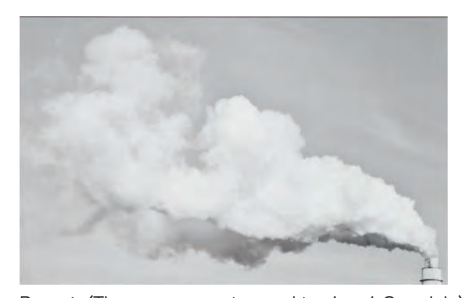
Portrait (The concept-artist smoking head, Stand-In), 2016