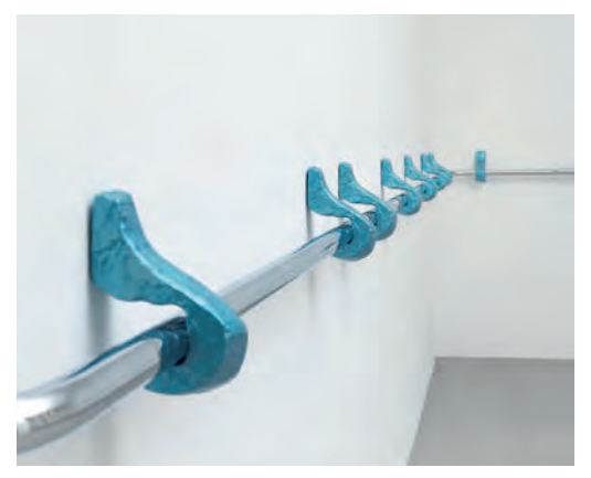
Off the Rack (Handtrail), 2014

With the support of the Marian Goodman Gallery