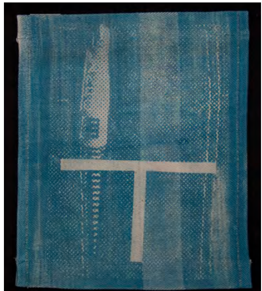
Mer fermée , 2019, cyanotype on fabric, 33 x 27 x 7 cm