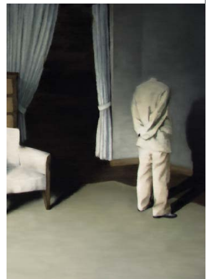
NGUYEN THAI TUAN Interior 2 (détail), Heritage series , 2011, huile sur toile / oil on canvas Collection Dinh Q Lê