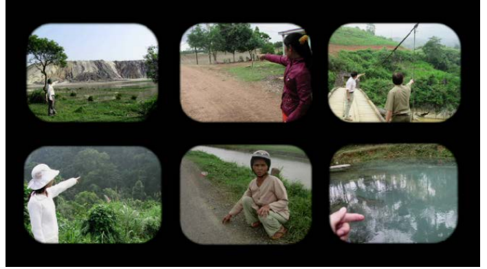
NGUYEN TRINH THI Landscape Series #1 (capture d'écran/still), 2013, vidéo.