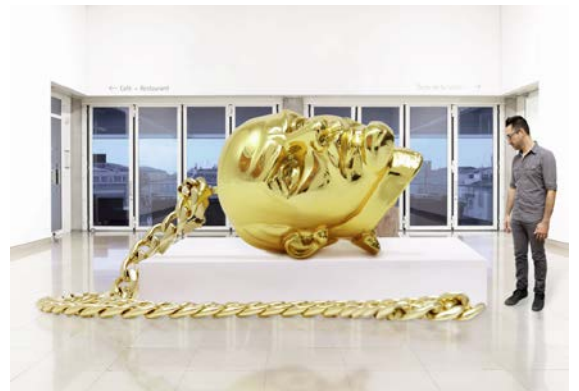
THE PROPELLER GROUP Monumental Bling , 2013, croquis de l'artiste pour l'installation / artist sketch of installation.