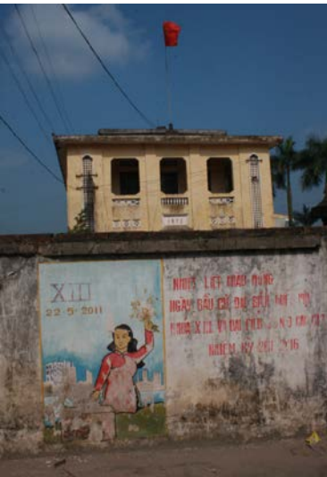
NGUYEN HUY AN image contextuelle : un message local du gouvernement / contextual image: a local government message