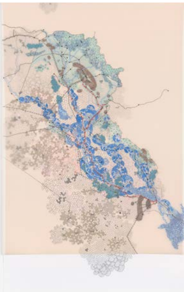
TIFFANY CHUNG Iraqi State Railways after Anglo-Iraqi Treaty 1930 & Current Pipelines , 2010, technique mixte / mixed media. Collection Agnes Gund, New York