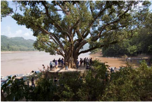
JUN NGUYEN-HATSUSHIBA The Ground, the Root, and the Air: The Passing of the Bodhi Tree (capture d'écran/still), 2004–2007, vidéo.