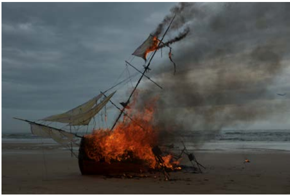
DINH Q LE Erasure (capture d'écran/still), 2011, vidéo