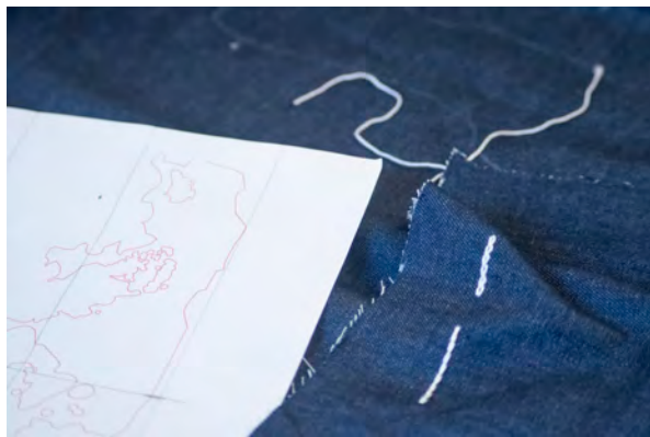
Au Revoir , 2019, work in progress.