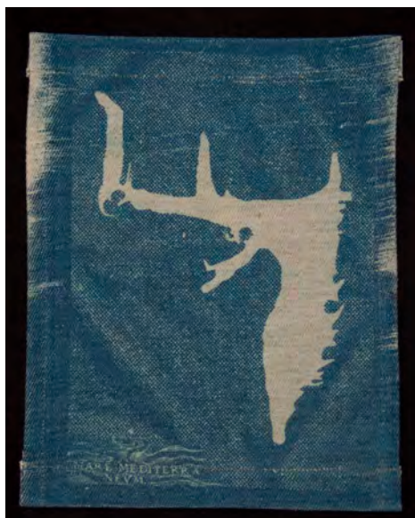
Mer fermée , 2019, cyanotype on fabric, 33 x 27 x 7 cm