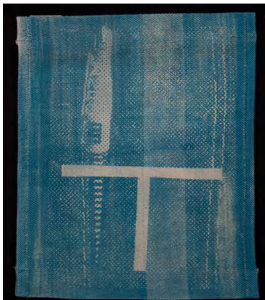
Mer fermée , 2019, cyanotype on fabric, 33 x 27 x 7 cm