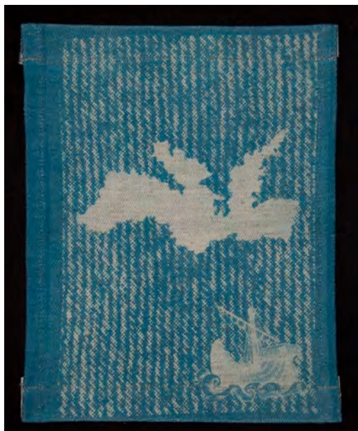
Mer fermée , 2019, cyanotype on fabric, 33 x 27 x 7 cm