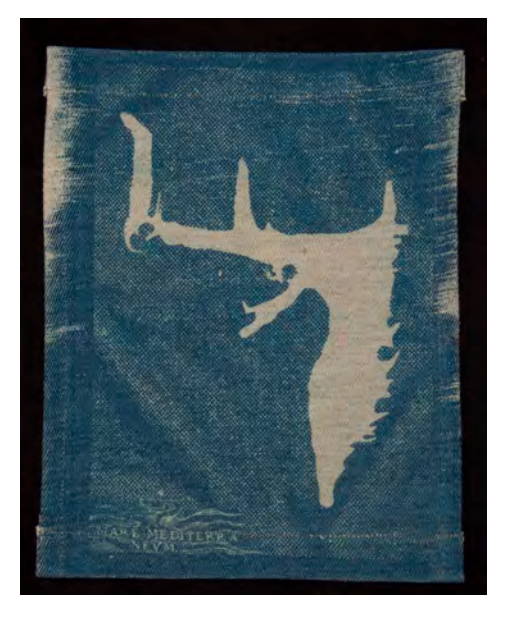
Mer fermée, 2019, cyanotype on fabric, 33 x 27 x 7 cm