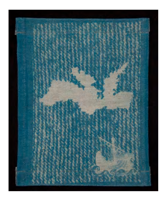
Mer fermée, 2019, cyanotype on fabric, 33 x 27 x 7 cm