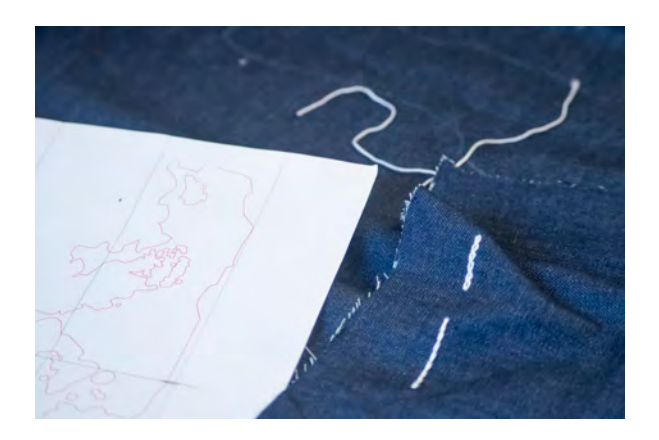
Au Revoir , 2019, work in progress.