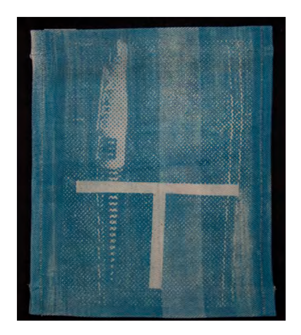
Mer fermée, 2019, cyanotype on fabric, 33 x 27 x 7 cm