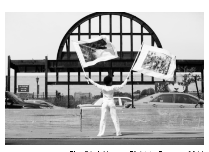
Pier 54, A Human Right to Passage, 2014