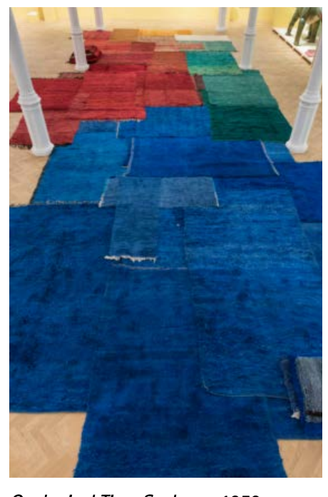
Geological Time Scale, ca. 1950