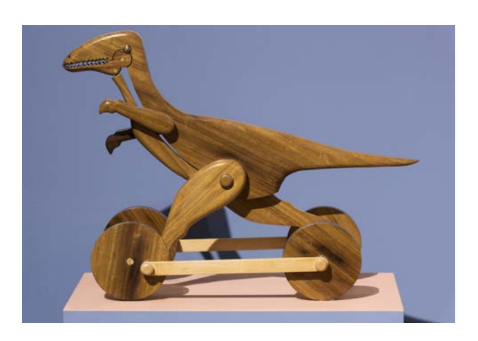
Carcharodontosaurus Toy, 2015