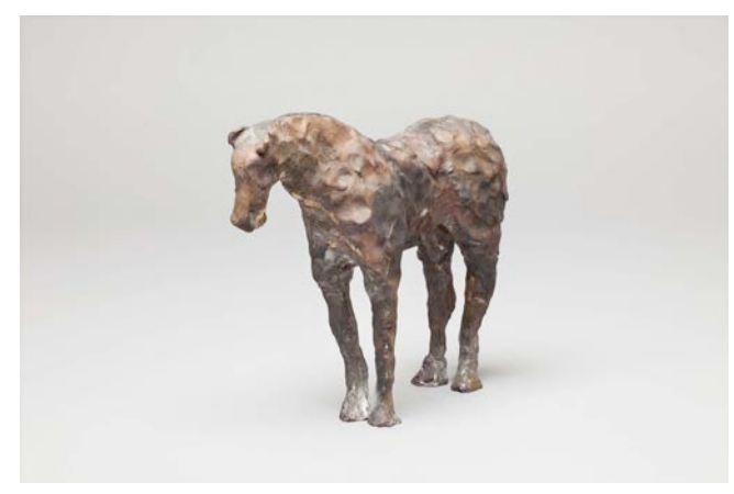
the aurora, 2013 bronze, h: 22,8 cm