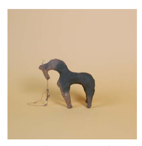
Sans titre (North african toys), 2014