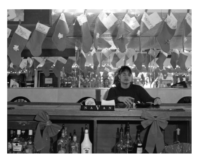
THE NOTION OF FAMILY Mom and Me In The Phase, 2007