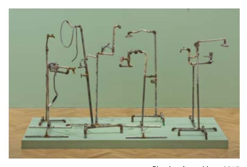
Plumber Assemblage, 2015