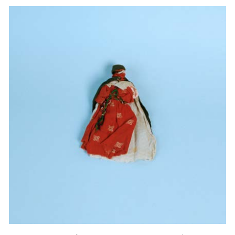
Sans titre (North african toys), 2014