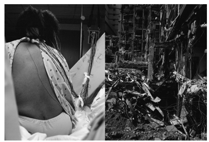
THE NOTION OF FAMILY Landscape of the Body (Epilepsy Test), 2011