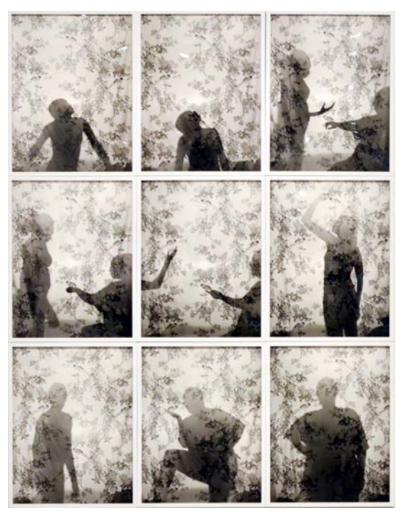
THE NOTION OF FAMILY Momme Silhouettes, 2010