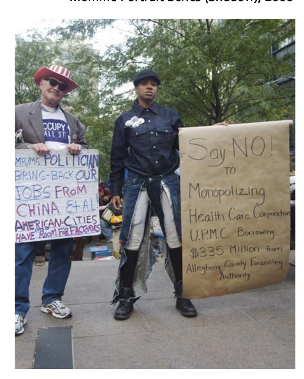
Corporate Exploitation and Economic Inequality, 2011