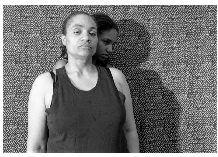
THE NOTION OF FAMILY Momme Portrait Series (Shadow), 2008