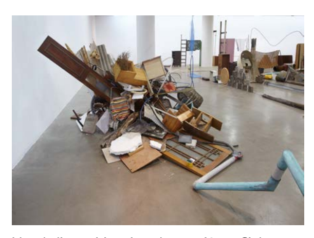
Vue de l'exposition Autodestrucción 8: Sinbyeong , Artsonje Center, Séoul, Corée du Sud, 2015