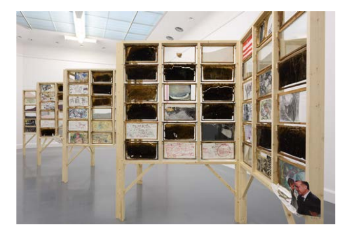
The Salt Traders, 2015