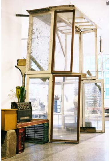
Vue de l'exposition Autodestruccion 6, Gdanska City Gallery 2, Gdansk, 2015