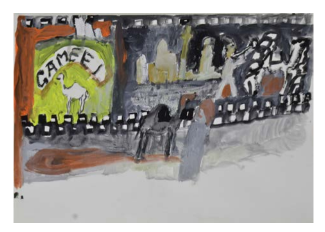
Cotton-Suez Canal, Camel, 2011