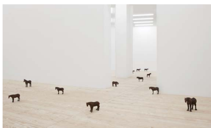
Primal, 2013, bronze. View of the exhibition at the Esther Schipper, Berlin 2013. <sup>©</sup> Ugo Rondinone

With the support of: Pro Helvetia ; Esther Schipper, Berlin ; Galerie Eva Presenhuber, Zurich ; Gladstone Gallery, New York & Brussels; Sadie Coles HQ, London