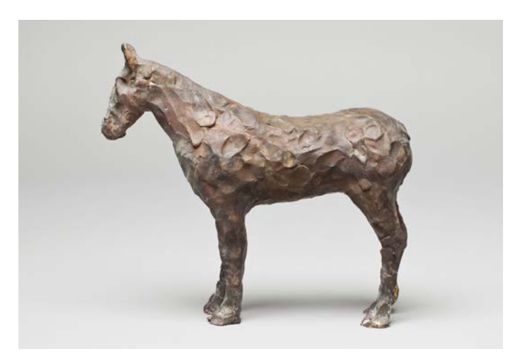
Primal, détail, 2013