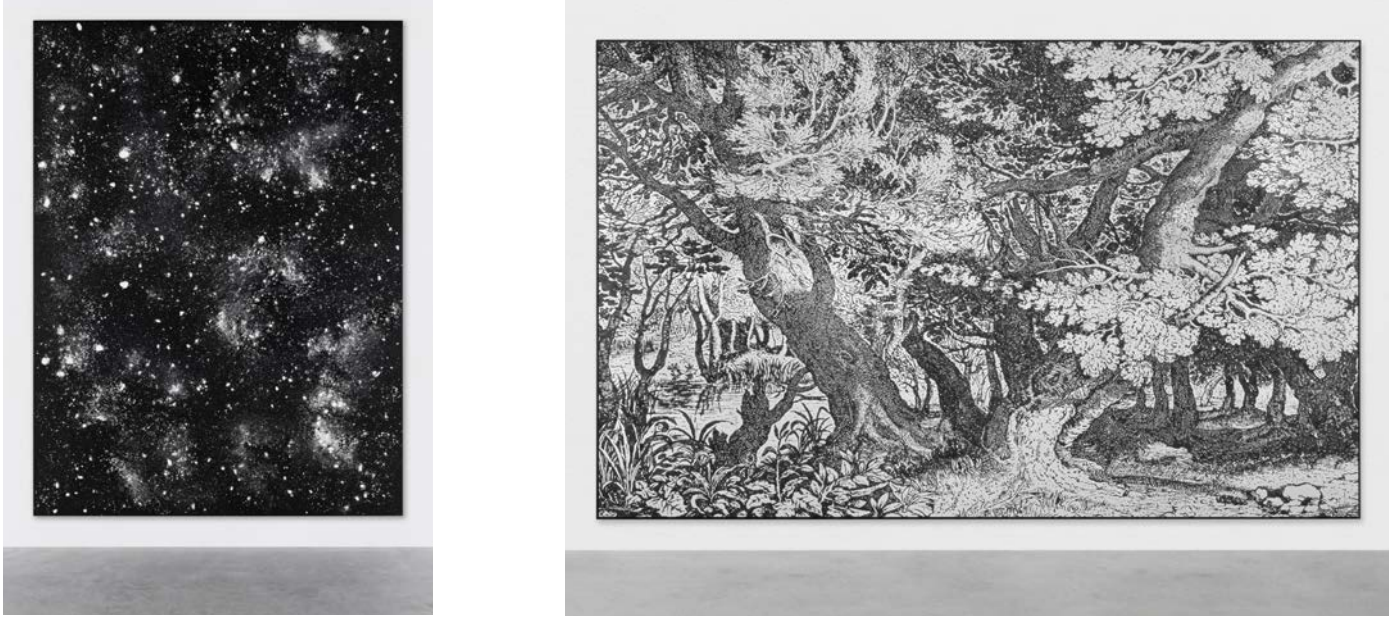
N° 559 dreissigsternovemberzweitausendundacht , 2008